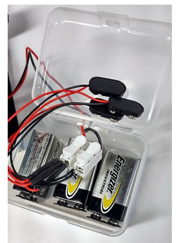
Open Battery Container