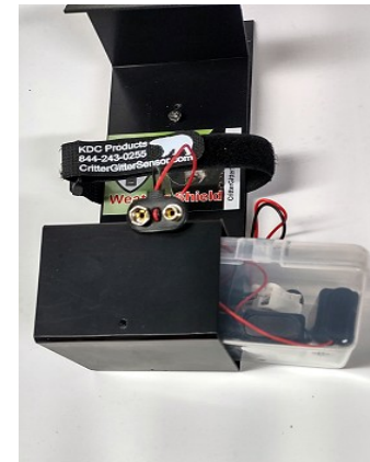
Insert Battery Container