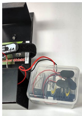
Slide Out Battery Container