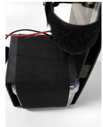
Reinstall Retaining Band