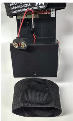
Remove Retaing Band